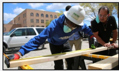
Workforce Curriculum, Grant Recognize HCDE's Commitment to Adult Learners pg. 3