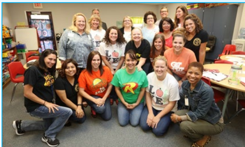
Staff from TLC and teachers from Golden Acres Elementary in Pasadena ISD