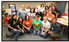
TLC Visits Title 1 Campus Golden Acres in Pasadena ISD pg. 3