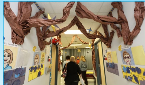
TLC staff tour the elementary school.

Golden Acres is seeking innovative ideas for engaging the students from our staff in TLC. TLC toured the school and provided insight on resources available through HCDE.