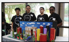
Education Foundation of Harris County Hosts Energy City of the Future May 14 pg. 5