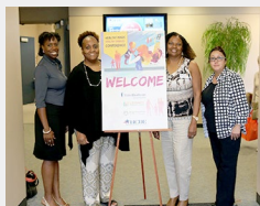
Nearly 250 Attend Head Start Healthy Minds Healthy Families Conference pg. 5