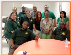
HCDE 'Goes Green' for Children's Mental Health Awareness Day pg. 4